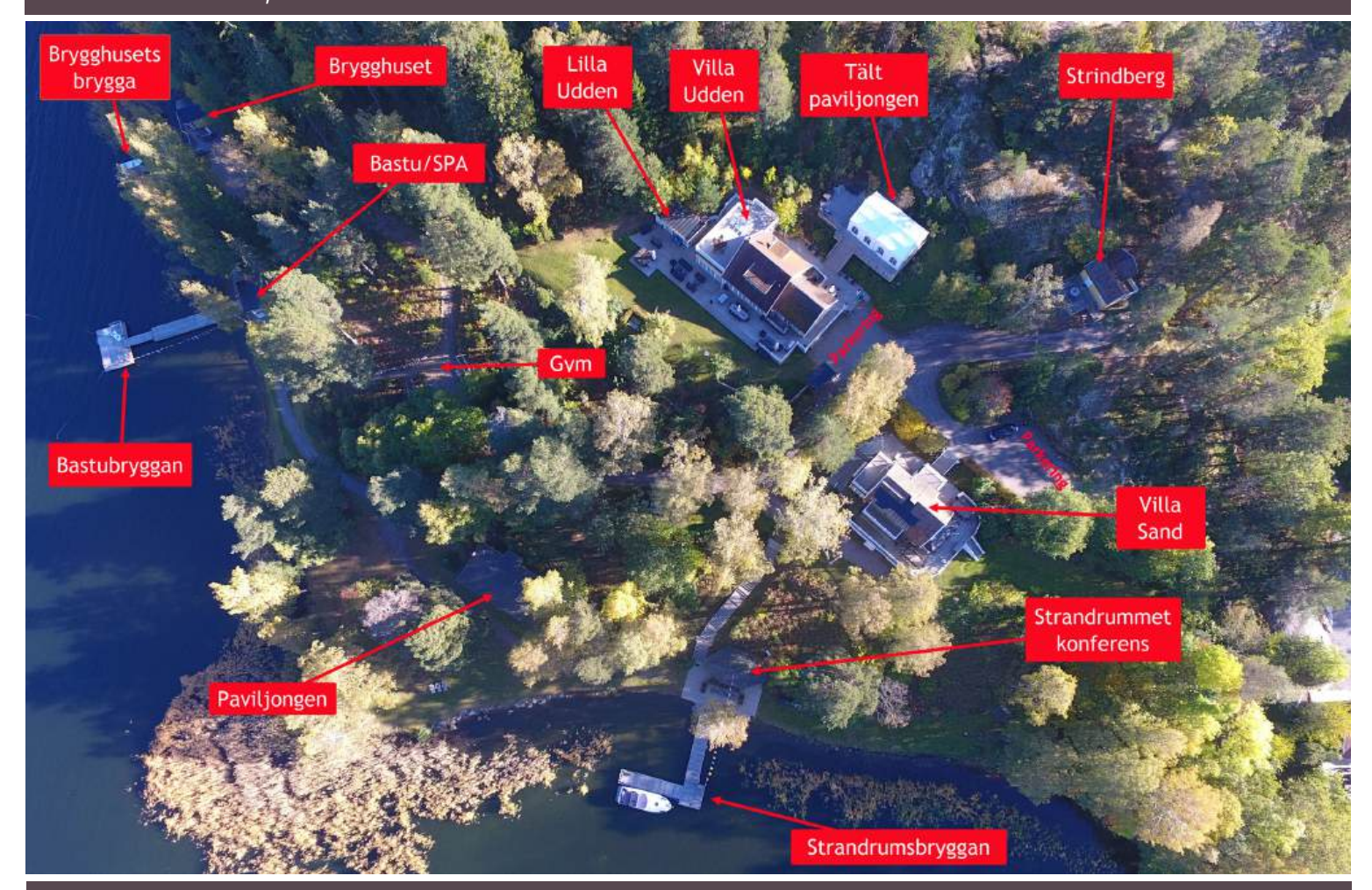
Villa Sandudden - An Archipelago Village - 25 minutes from central Stockholm. Villa Sandudden has 44,000 m2 of beautiful park-like lakefront land with 400 metres of beach. Link to map

We can also offer a variety of other free activities - take a nice walk or jog in the woods, sit on the jetty with your toes in the water, borrow a rod and try your luck at fishing from one of the jetties, do a session together in the outdoor gym, borrow a SUP or rowing boat. Challenge each other to a board game: boules, cube, tug-of-war, football, table tennis, chess indoors or out, and more - the possibilities are endless. We can also offer a wide range of activities through our partners: Öppet Hav och Aktivitetsteamet. For example: Kayaking, team building, laser clay pigeon shooting, various competitions inside and outside, etc.